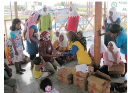
HKI field staff distributes iron fortified soy sauce to IDPs