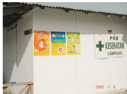
Promotion & education materials distributed to a barrack