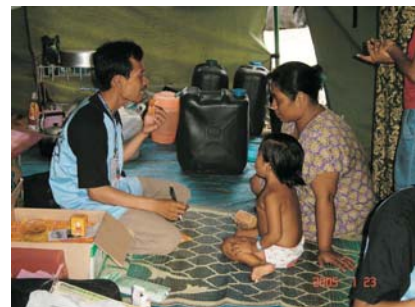
HKI field staff explains to mother about the use and benefits of Vitalita Sprinkles